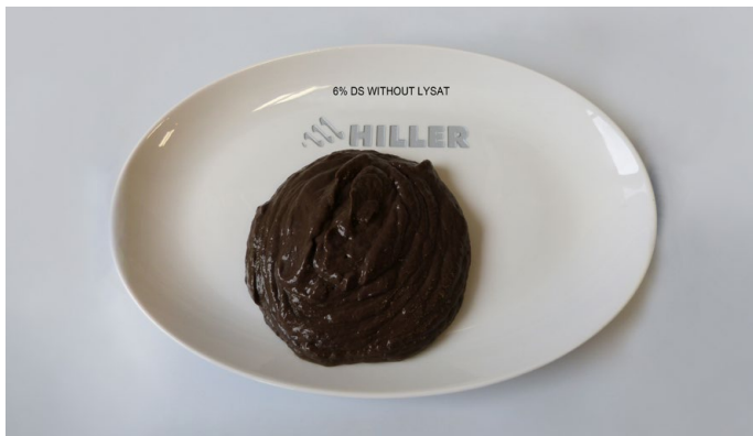
6 % DS without lysat