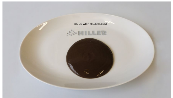
8 % DS with HILLER lysat