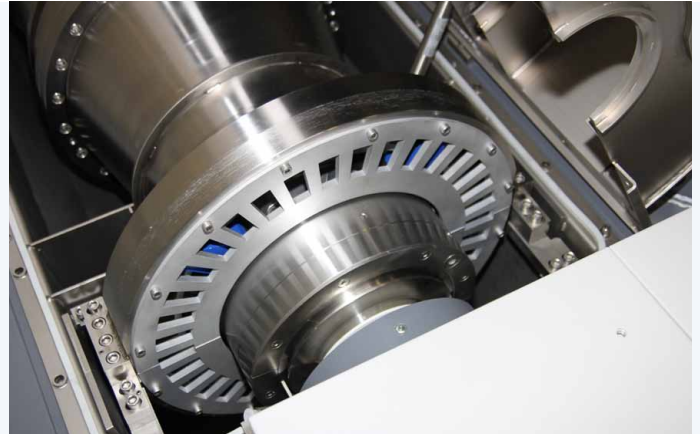
HILLER lysate device