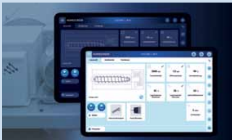
HILLER wins the German Design Award!