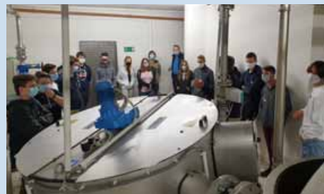
HILLER trainees at excursion!